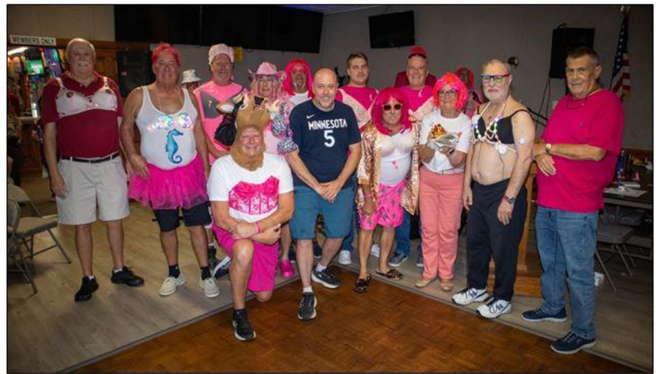
With October being Breast Cancer Awareness Month, the Calabash Elks Lodge held a fundraiser called "Bras Across the Bar" to raise money for "Bold and Beautiful," a facility in Little River that specializes in making wigs for women undergoing cancer treatment. The event raised $3,500, which will be used specifically to aid those who cannot afford the wigs.

The Sandpiper December 2024 / January 2025 Edition Page 9 of 27